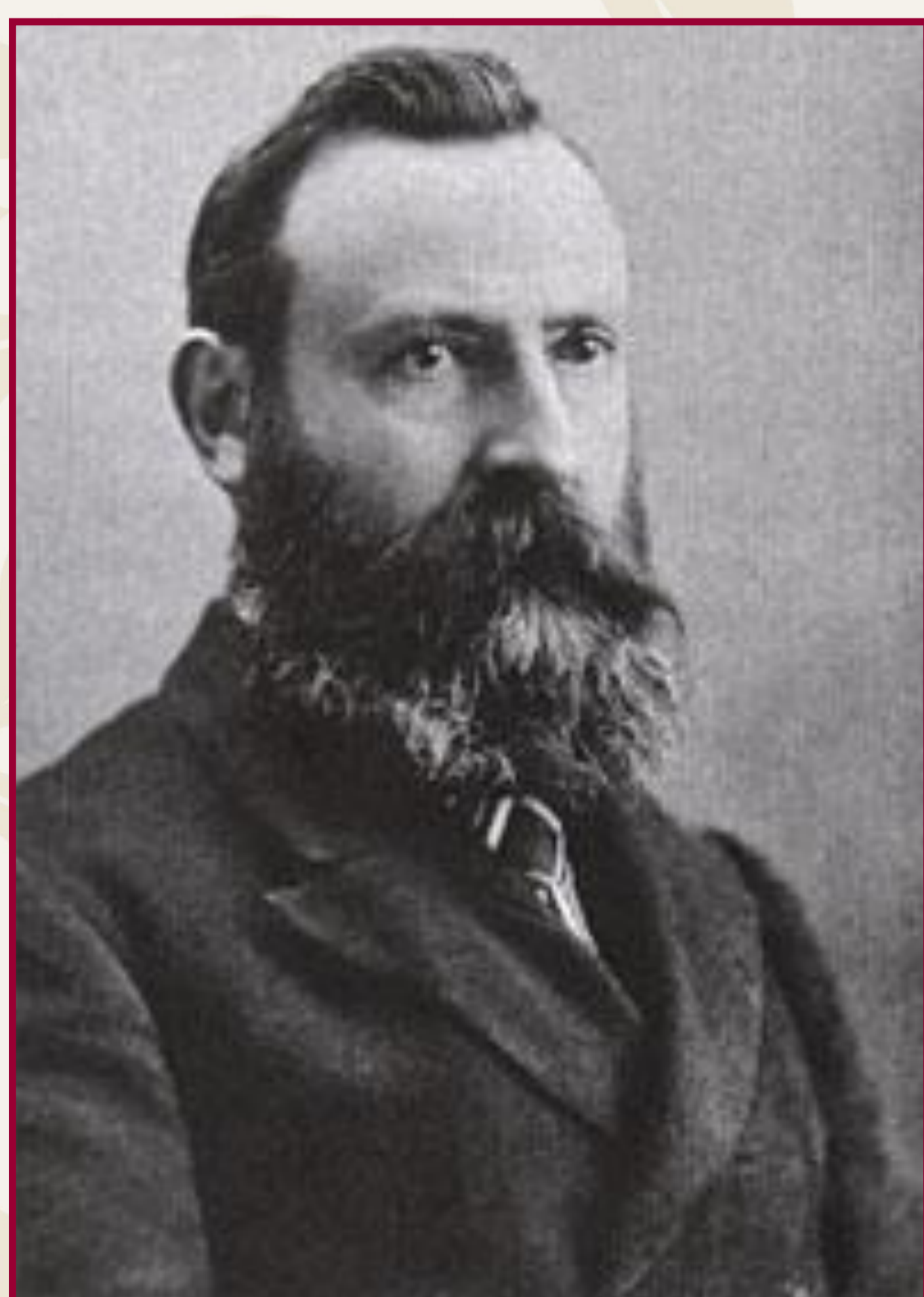
William Wynn Westcott 17th December 1848 to 30th July 1925